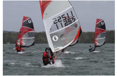
Check out MYC Juniors sponsors - thank you!

Manly Yacht Club was well represented in both the Gold and Silver O'pen Skiff divisions and in the ICLA4 (4.7 laser) and ICLA6 (Radial laser) fleets.