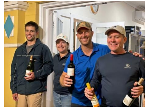
Phantom Menace, Arosa and Stock Car