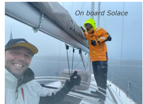
On board Solace