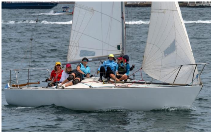
All female crew on Kaotic - taking it easy after the finish