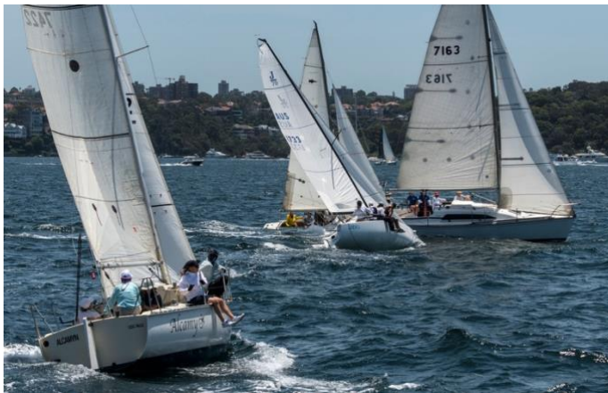
Alcamy, Melody, Jabiru and Andiamo! - Division 2